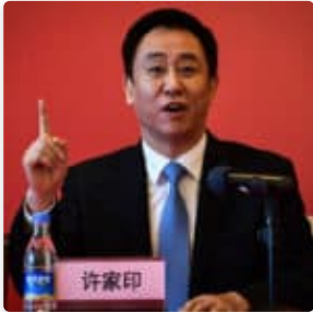
Evergrande Proposes $2.14B Dividend and More Asia Real Estate Headlines