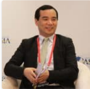
Anbang Launches Sales of Waldorf Astoria Condos and More Asia Real Estate Headlines