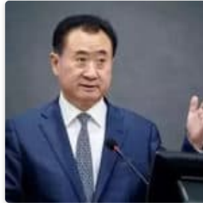
Dalian Wanda Gets $800M Offshore Club Loan and More Asia Real Estate Headlines